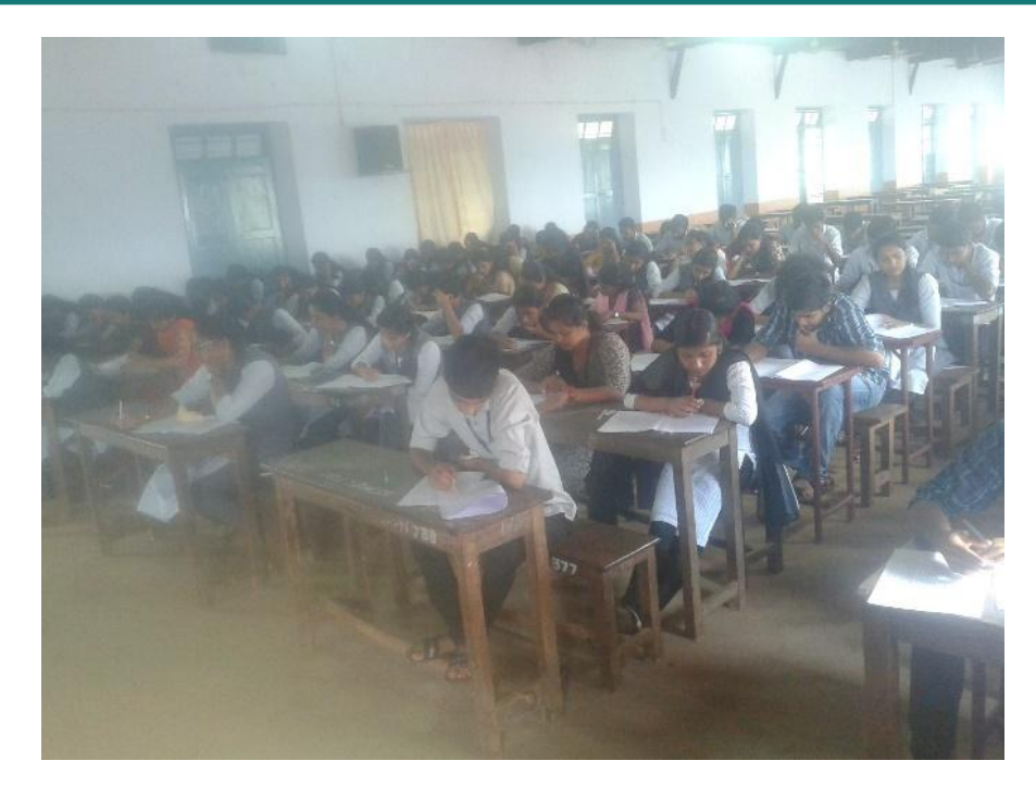
Students attending the JAM Model Test...