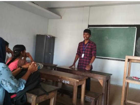
Discussion on Topics of contemperory relevance...