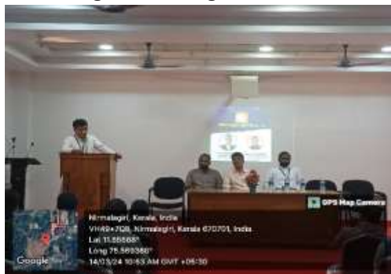
UBA-Inauguration Programme Meeting