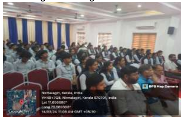
UBA-Inauguration Programme Meeting-Participants