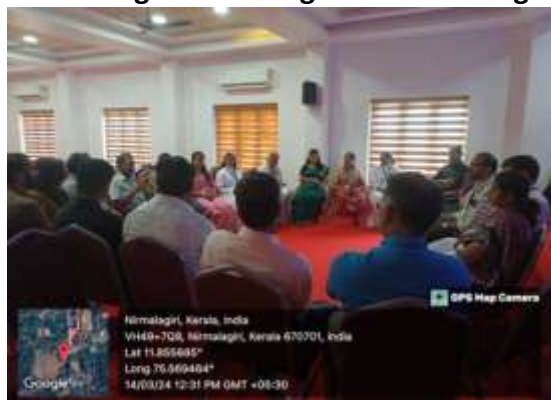
UBA-Inauguration Programme Meeting-Discussion