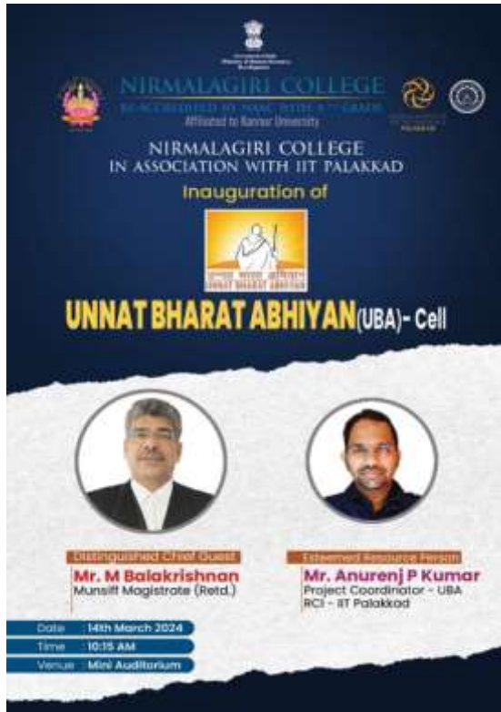
UBA-Inauguration Programme Brochure